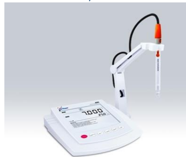
Multi Parameter Meter pH, ORP, etc.