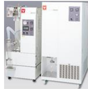
Spray Dryer & Organic Solvent Recovery