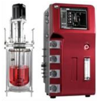
Bioreactor / Fermenters