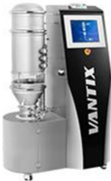
Fluidized bed dryer